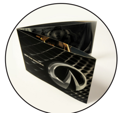
PIN code camera matched to mailing address